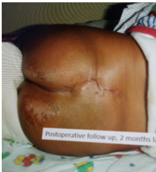
Figure 3: First postoperative follow-up with wound healing

was taken. Reviewed on 1 st June 2011, the child presented with a well-healed surgical wound and in good general condition (Figure 3).