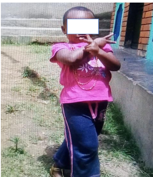
Figure 4: The second follow up review of the child at 3.6 years-old

Follow up at 3 years 6 months of age was planned on 18th August 2014 and the child had started school, was in nursery three and growing normally without any problem (Figure 4).