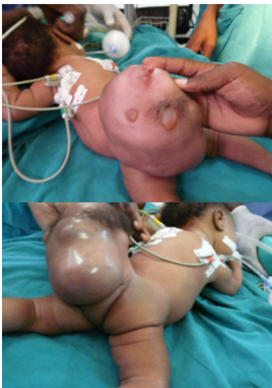
Figure 1: Pre-operative mass examination and evaluation

Neonatal examination revealed a sacrococcygeal haired mass of 34cm circumference, nodular, bony-hard feeling underneath the skin, not tender, mobile and vascularized. The mass was located at around 4cms above the permeable anus, a head-like mass with a tuft of hairs. Viewed at the anterior, which is the most posterior aspect, sacral mass was a face-like similar to a "cyclopia face" (Figure 1).