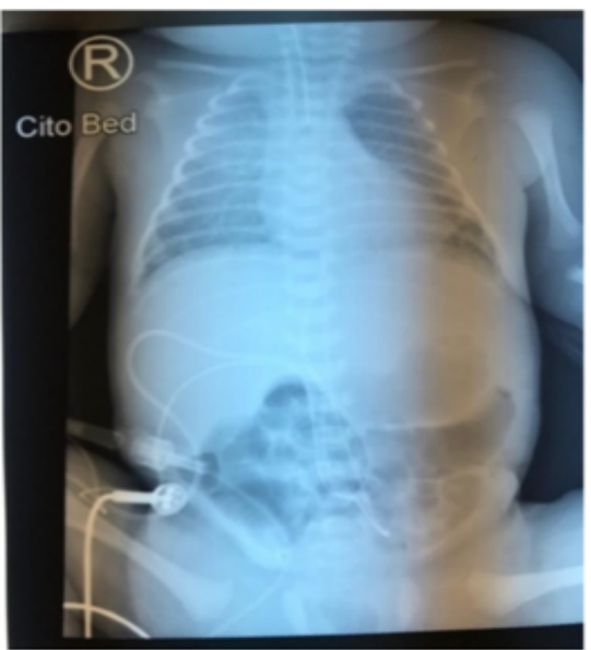
Figure 1: A chest x-ray taken 6 days after surfactant administration