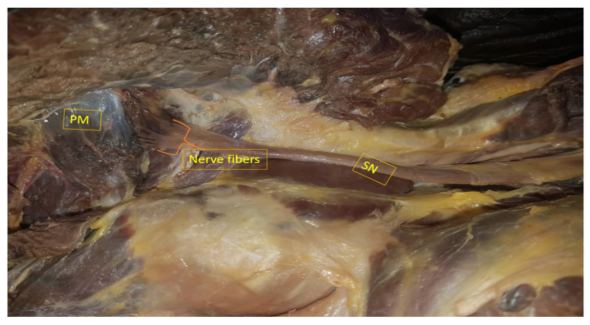
Figure 1: Unreported pattern where many separated fascicles pass under the piriformis before making one sciatic nerve trunk. PM: piriformis muscle, SN: sciatic nerve

This case was identified while dissecting in the Anatomy laboratory of the School of Medicine and Pharmacy at the University of Rwanda. A 46-yearold male cadaveric donor was dissected following the steps outlined in the Grant Dissector Handbook of Sauerland [12]. The case presented an unusual pattern of formation and termination of the SN. It was observed that in the left gluteal region, the sciatic nerve had five smaller fascicles below the piriformis muscle (Figure 1). The fascicles measured 7.5 centimeters from the nerve roots to the formation of the common trunk of the sciatic nerve. From the point where the fascicles joined to form the common trunk of the sciatic nerve to its termination at the popliteal fossa, the sciatic nerve measured 32.4 centimeters in length. The sciatic nerve gave a branch that supplied the popliteus muscle in the posterior compartment of the leg before it terminated at the popliteal fossa (Figure 2). The sciatic nerve trifurcated at its termination by giving rise to the tibial nerve, common peroneal nerve, and another unusual branch that supplied the medial head of the gastrocnemius muscle.